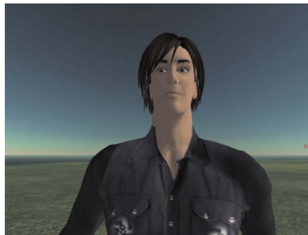
FIGURE 1 Avatar of the First Author

Once you have an account—you download the Second Life™ client (or viewer) which is what is used to connect to the virtual world. Users of Second Life™ are known as residents and being inside Second Life™ is referred to as being in-world. Second Life™ content is created and owned by users who retain intellectual property rights to the content. The content creation tools are